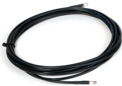
fig. 1. Mounting

“...” List cable length to complete product references. Other cable length on request. Please contact support@comatreleco.com.