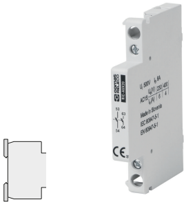
fig. 1. Wiring diagram