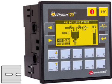
fig. 1. Dimensions (mm)