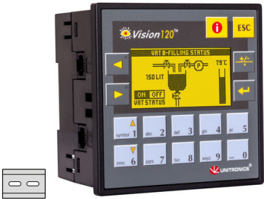
fig. 1. Dimensions (mm)