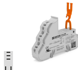
fig. 1. Wiring diagram