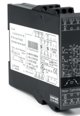
fig. 1. Wiring diagram