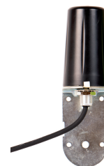
fig. 1. Dimensions (mm)