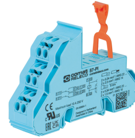
fig. 1. Wiring diagram