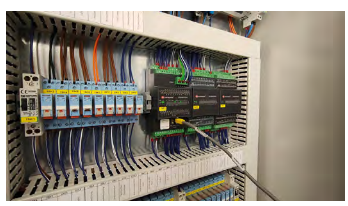
Control cabinet with PLC and ComatReleco products

reprogrammed. The controls offer a comprehensive range of functions with snap-in modules for inputs and outputs as well as memory to record and document on-site events. They can be expanded in modules and individually parametrised, thanks to the sequencer. There are no licencing fees for the software to program the PLC.