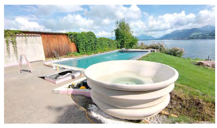
Customer project with swimming pool and hot tub, including fountain.

So the swimming facilities can be operated at the appropriate level, control visualisation is divided into a customer view and maintenance view to enable parametrisation. In the customer view, changes such as hardware outputs and timings can be easily and intuitively made using a 7" touch screen, without the software having to be