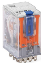
2021 Electro-mechanical relay with 4 changeover contacts

The electromechanical relay is the most frequently used switching element in the world. Its roots lay in the 19th century and had their origins in the telegraph era. In the relay stations, signals weakened by long lines were refreshed. Today's relays are electromechanical masterpieces of the highest precision and perform a variety of tasks in all conceivable industrial sectors, including the railway industry.