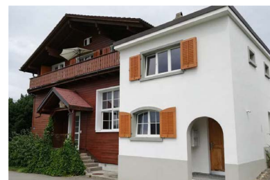
The multifunctional remote control device is well suited for vacation homes.

Thanks to separate access, several users can access and control the same device via the app. The Müllers have set up two accounts, one for the parents and one for the adult daughter. «If I spontaneously want to spend a weekend in our vacation home in winter, I can turn on the heating before I leave,» says daughter Yasmine Müller. The remote control can be used to monitor various parameter applications. In the vacation apartment in Valais, the heating is monitored so that any malfunctions are detected early and consequential damage can be avoided. The rainwater tank is now also monitored by means of water level sensors. The sensors report a high or low level from the tank. If the water level is low, the pump is deactivated via internal programming in the device itself. When the water level has risen again, the device reactivates the pump. This makes it easier and more accurate to control automatic irrigation in summer – and the Müller family not only save on heating costs with the new remote control unit, but also protect the environment.