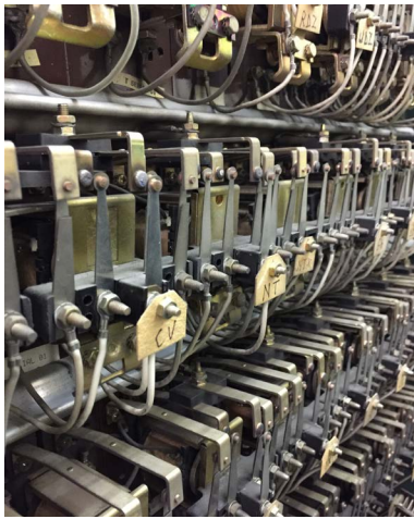
1970s Relay control (1971 the microprocessor is invented in the USA)