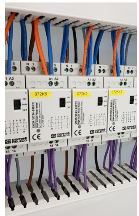
CHI34 power relays

MB Systembau AG has been awarded the contract to renew part of the operational safety systems and the building services - in this case the lighting - in the operations and maintenance centres behind the main tunnel. The lighting concept for the caverns has been completely revised and all existing lamps are to be replaced by LED lamps. The reasons for this choice are the longevity of the lamps and their low energy consumption. Modern light sources with control devices generate current peaks when switched on that can be up to 250 times higher than the rated current. To break these peaks, power relays with appropriate contact technology are needed. MB Systembau AG has chosen the power relays of the CHI34 series from ComatReleco to handle this task. These can switch inrush currents of up to 800 A at a rated current of 16 A and ensure the smooth functioning of modern light sources.