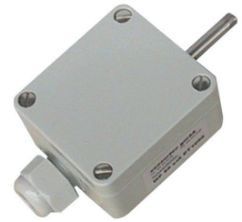
fig. 1. Dimension (mm)